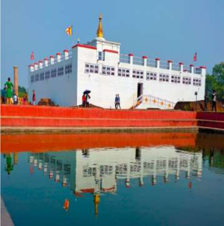
Lumbini Maya Devi Temple